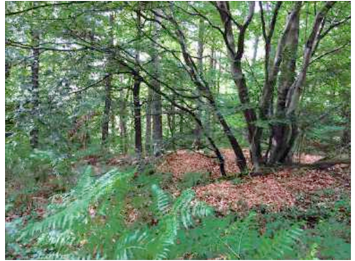
Coppiced beech in the woods adjacent to High Thicket Road.

Just about everyone I know has taken the opportunity of lockdown to have a big clear out, not least of all of their larders, and we are no exception. Hiding at the back, we found a jar of 'Merry Christmas Preserve'. The 'best before' date? 12 October 2005. And you know, it was delicious. Will anyone own up to finding anything older?