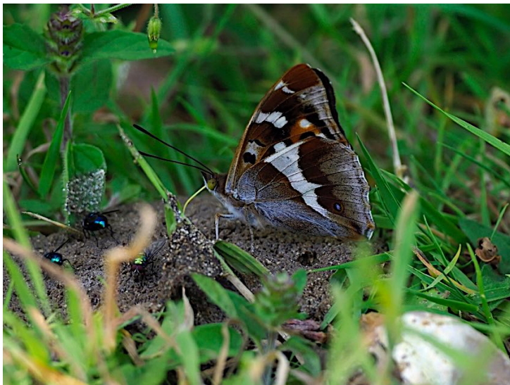
Underside of wings of Purple Emperor with Common Green Bottle flies on dog poo

However, on the way back, we saw a group of enthusiasts clicking away with cameras at a butterfly on the ground – and yes, it was a Purple Emperor, attracted to the minerals found in dog poo. His Imperial Majesty gave us plenty of photo opportunities, seeming undisturbed by the 8 or 9 people gathered round, and displayed his purple upper side as well as the patterned underwing which made for spectacular photographic opportunities.