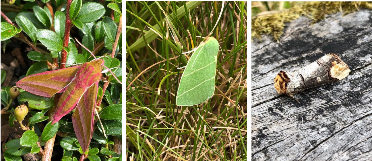
Left to right: Elephant Hawkmoth, Scarce Silver-lines and a well camouflaged Buff-tip moth.