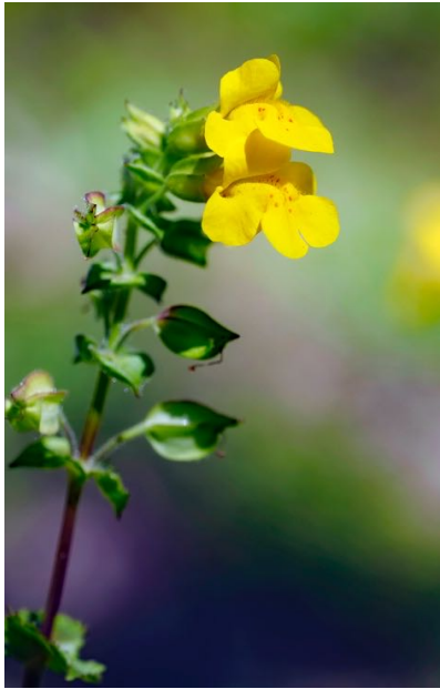
Yellow Monkeyflower standing 30-40 cm tall