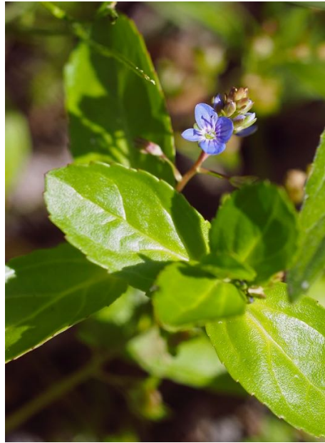
Brooklime (flower 7 mm) a low-growing creeper