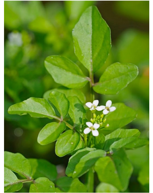
Watercress (flower 3-4 mm) on water's edge and in pond